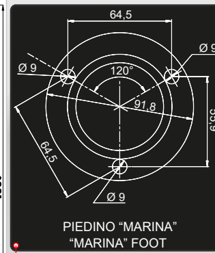
PIEDINO "MARINA" "MARINA" FOOT